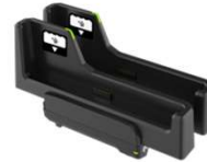
Two-slot Battery Charger