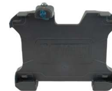
Gamber Johnson Slim Cradle