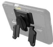
Kick Stand with Rotating Hand Strap