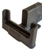
Zebra Connect Cradle for Workstation Connect