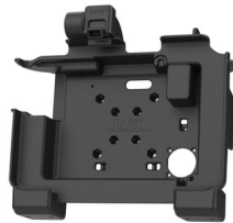
RAM form fit holder