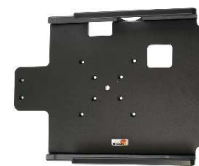
Brodit Passive holder