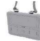
Shoulder Strap 2