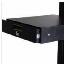
Lockable 3" Drawer for NB & PC Series

A sampling of the currently available accessories is pictured below. You can find the complete line of modular accessories at www.newcastlesys.com/accessories .