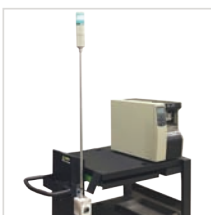
Safety Light for NB & PC Series