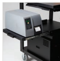
Slide-Out Printer Tray for EC, NB & PC Series