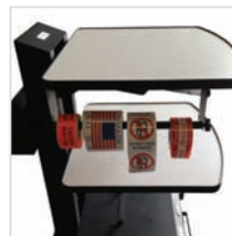
Label Holder for NB & PC Series