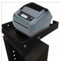
Small Printer Tray for NB, PC & Atlas Series