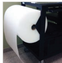
Bubble Wrap Holder for PC Series