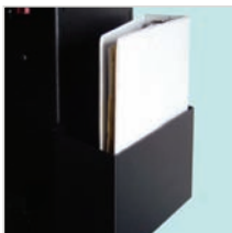
Binder Holder for NB, PC & Atlas Series