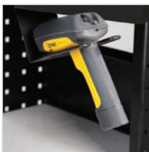
Scanner Holder for EC, NB, PC, Apex & Atlas Series