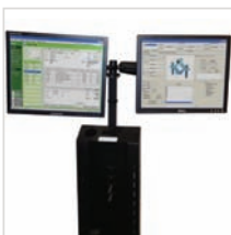
Single & Dual Monitor Mount & 30" Pole for EC, NB, PC, Apex & Atlas Series