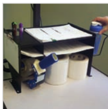
Desk Organizer for NB & PC Series