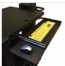
Keyboard Drawer for EC, NB, PC & Apex Series