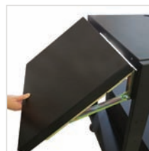
Folding Shelf for EC, PC & Atlas Series